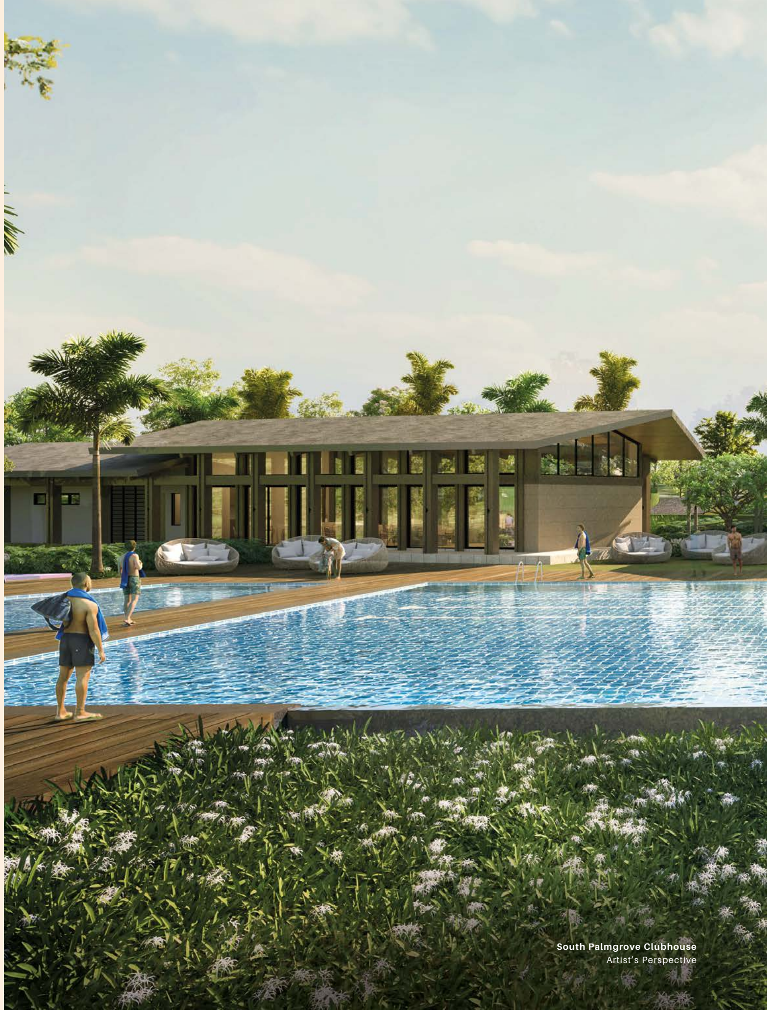
South Palmgrove Clubhouse Artist's Perspective