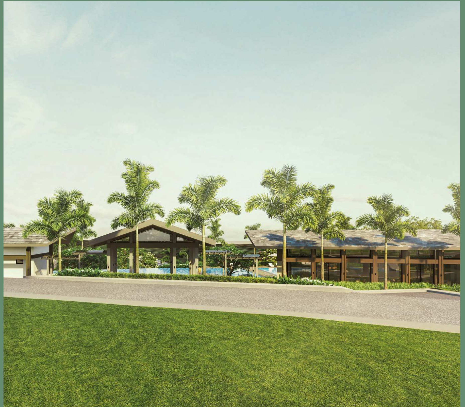
South Palmgrove Clubhouse Artist's Perspective

Alveo Land expands the tradition of industry excellence with a commitment to innovation, best realized through fresh lifestyle concepts and living solutions, pushing boundaries in dynamic communities and diverse neighborhoods across the nation.