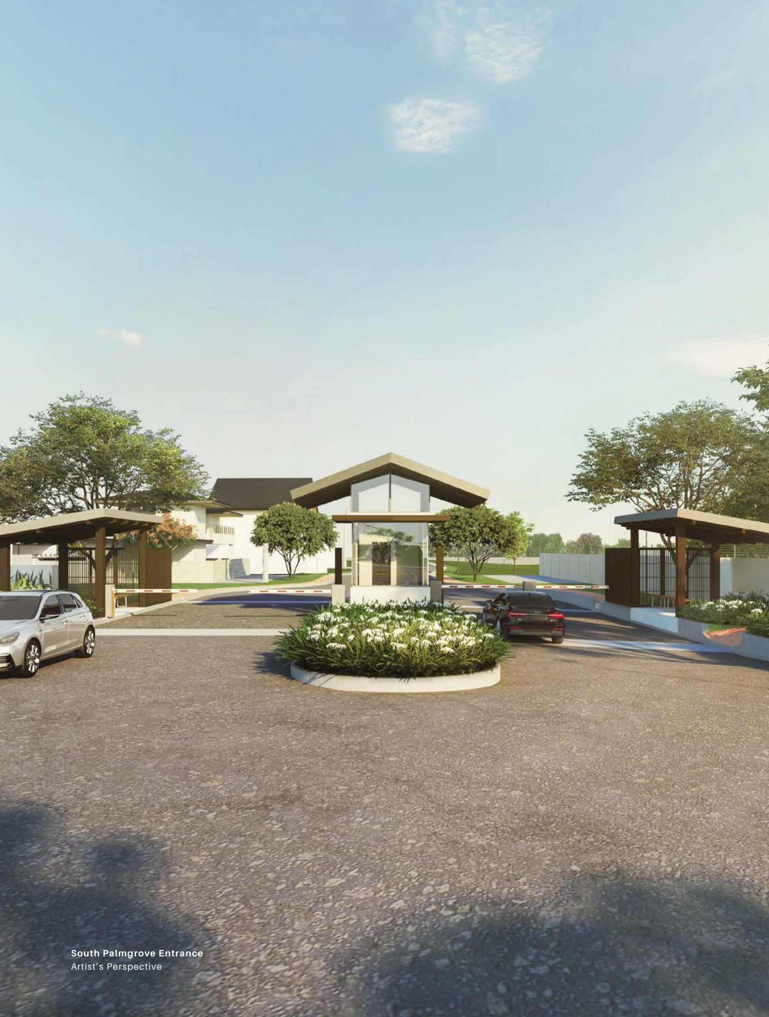
South Palmgrove Entrance Artist's Perspective

Embrace the calming comfort of a secure residential community. South Palmgrove allows you to appreciate the simple quiet moments to nurture precious time with friends and family.