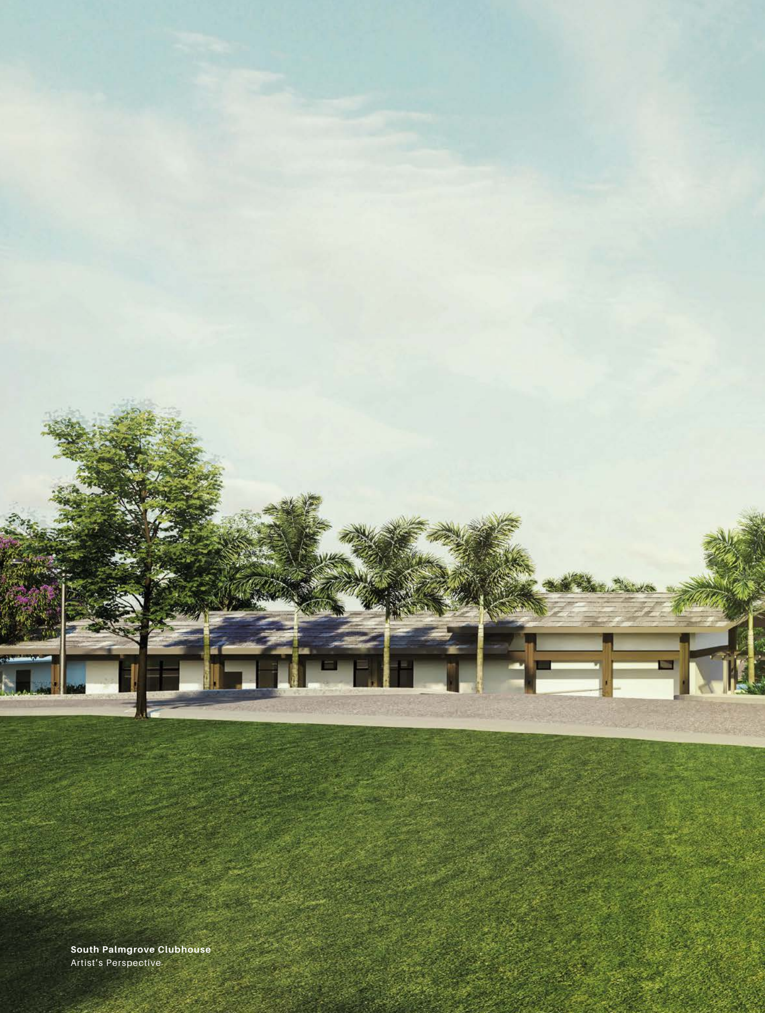
South Palmgrove Clubhouse Artist's Perspective