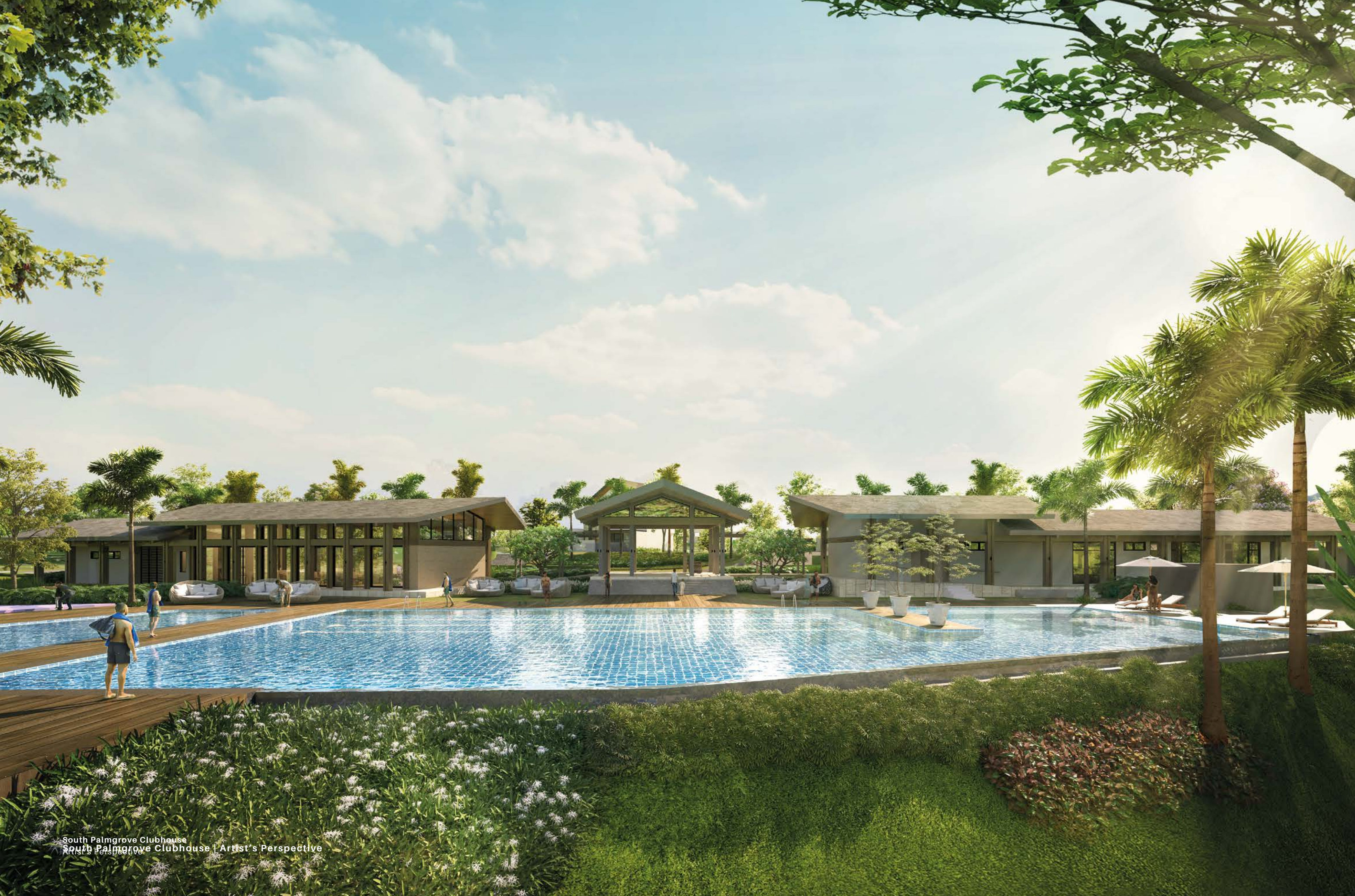
South Palmgrove Clubhouse South Palmgrove Clubhouse | Artist's Perspective